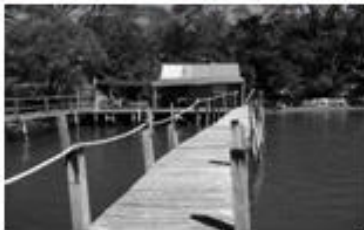
Ref. No.: _____ View North