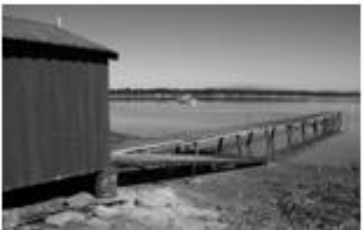
Ref. No.: ____ View South