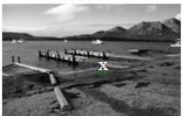
Ref. No.: ____ View South