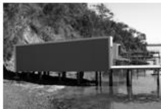
Ref. No.: ____ View West