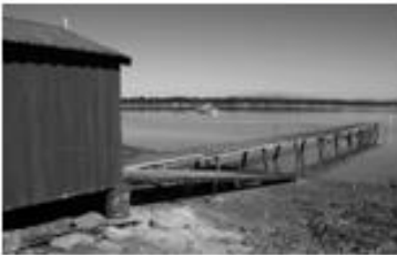
Ref. No.: ____ View North