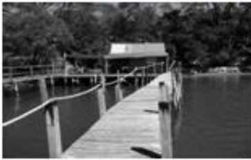
Ref. No.: ____ Wide View of structure