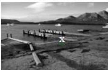
Ref. No.: ____ View South