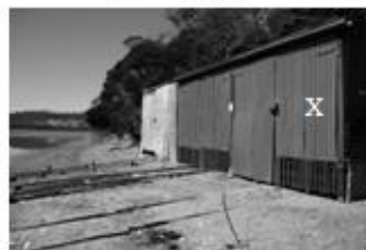
Ref. No.: ____ View West