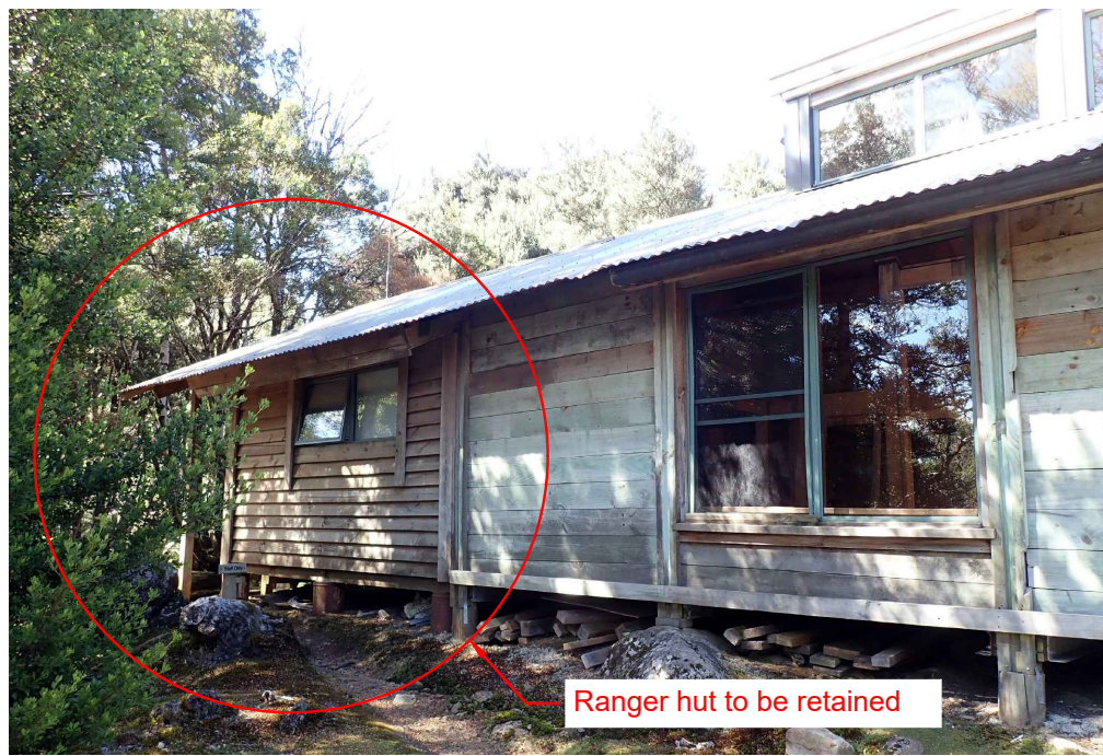
Image 1: Public hut LHS to be demolished and and rangers hut (retained)